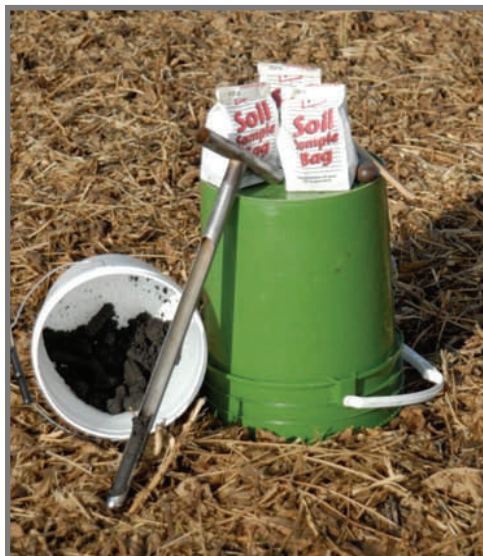
Soil sampling at harvest.

Grid Sampling: Grid sampling uses a systematic approach that divides a field into individual squares or rectangles of equal size, often referred to as "grid cells." Common grid cell sizes include 2.5-acre grid, 4-acre grid, and 8-acre grid sizes. Global positioning system technology (GPS) is frequently used to identify precise soil sampling locations. Once sampling site locations are identified, a composite soil sample is pulled from