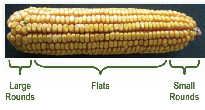
Figure 1. Seed size and shape on a corn ear varies from large rounds (left; cob base), flats, to small rounds (cob tip).

This is the area where seed size and shape does matter. Planter settings should be adjusted for accurate seed positioning,