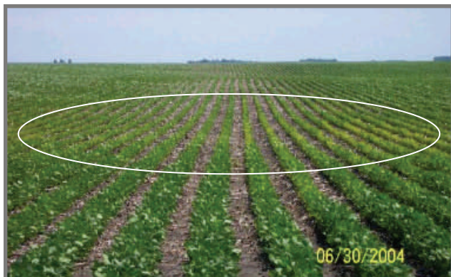
Iron deficiency symptoms in a soybean field.

The two most common micronutrients deficiency are Fe and Mn. Iron deficiency chlorosis (IDC) occurs on calcareous soils (pH > 7.4). Deficiency symptoms include interveinal chlorosis of young, upper leaves and plant stunting, which are similar to Mn deficiency. IDC deficiency is difficult to correct but can be managed by improving soil drainage in heavier soils, however, variety selection is the best method to manage Fe deficiency. Other management options include the combination of selecting the right variety, improving soil drainage, maintaining high level of P, and Fe foliar application.