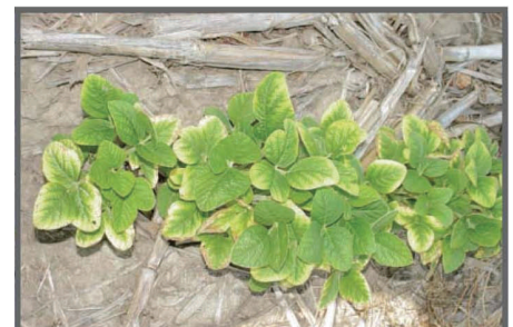
Potassium deficiency symptoms in soybean.

Boron, Calcium, Copper, Iron, Manganese, Molybdenum, Sulfur, Zinc